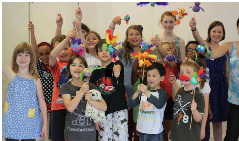
Spark Children's Puppetry Company starts March 2013!